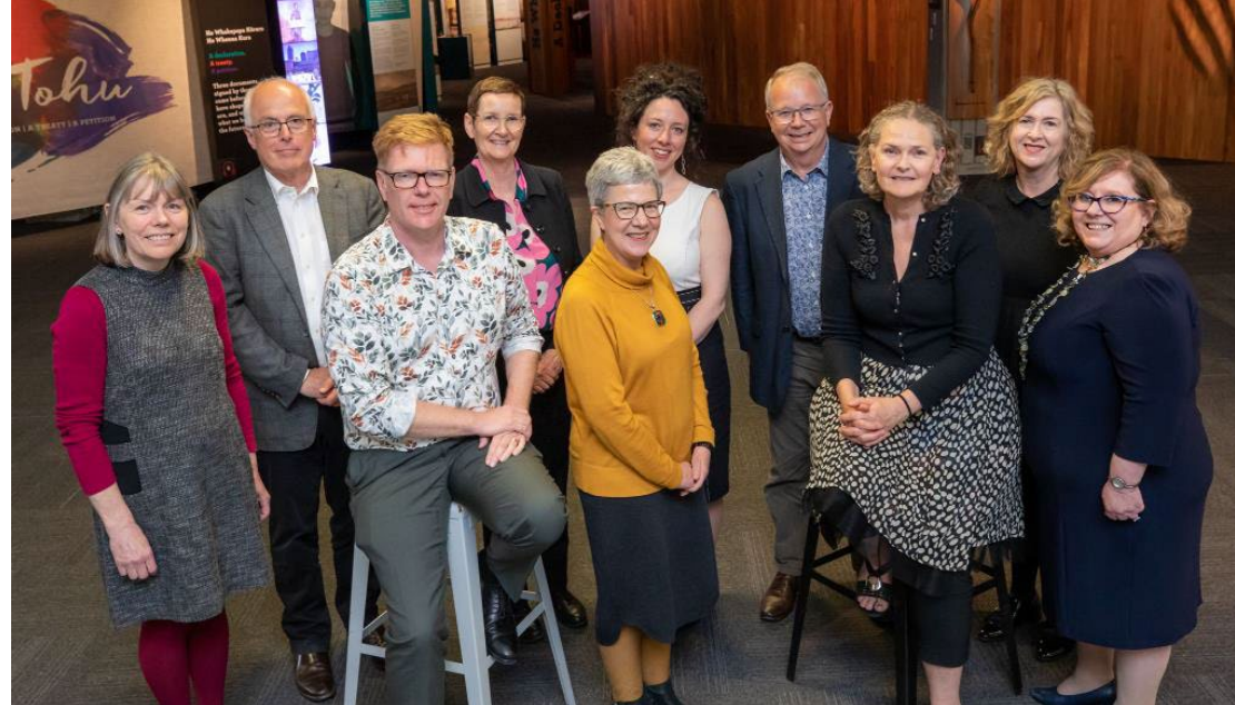
Board members at the National Library of New Zealand in November 2022.